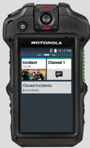
Si500 Body-Worn Camera

Our camera portfolio is designed to work seamlessly with CommandCentral Vault to help you renew trust. Learn more at motorolasolutions.com/trust.