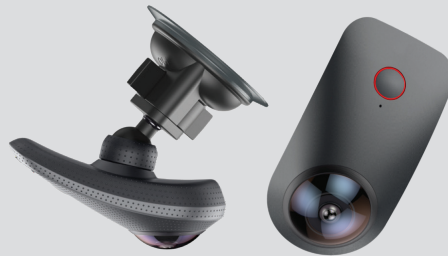
Sr600 In-Car Camera